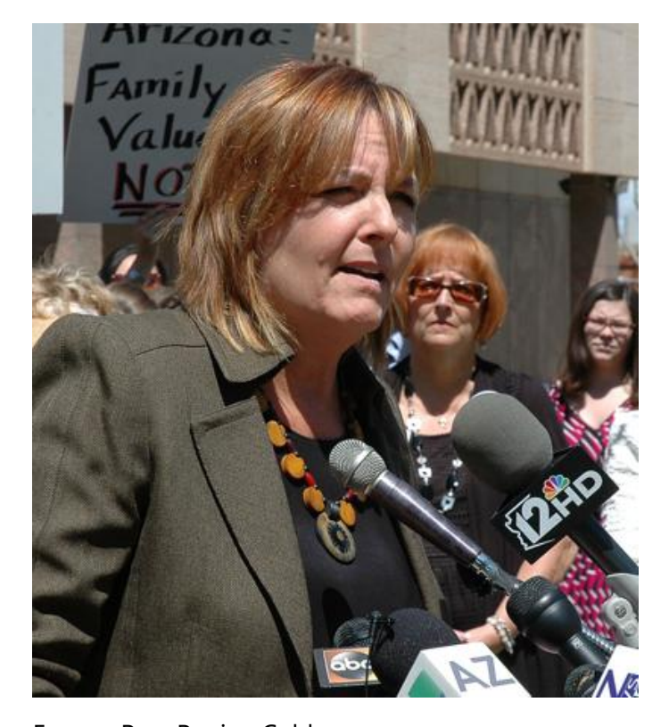
Former Rep. Regina Cobb

She sponsored a bill in 2016 to allow cities in counties that have adopted such a rule to opt out if they meet other qualifications, like having a water-recharge program, adopting a water-conservation program, putting only low water-use plants on rights of way, and funding programs to replace high water-use plumbing fixtures.